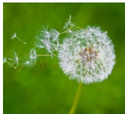
Dandelion seeds are dispersed by air

Use the pictures to add additional details to the key details. Read the passage.